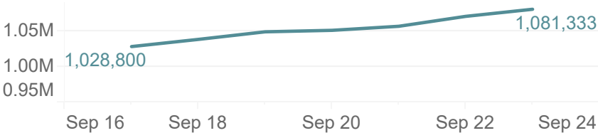
(2) Resolving Other Eligibility Issues